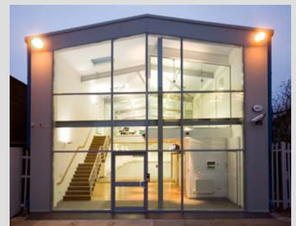
DHA Offices before and after